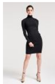
56220 Aurora Dress