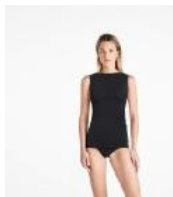
56219 Aurora Top