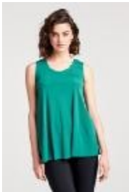
52729 Aurora Pure Top