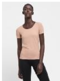
52764 Aurora Pure Shirt