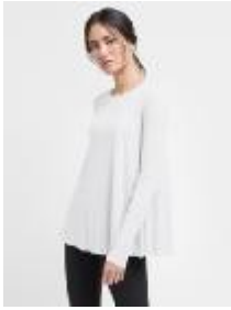
52766 Aurora Pure Pullover