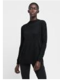
52748 Aurora Wool Pullover