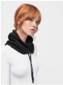
96370 Aurora Wool Scarf