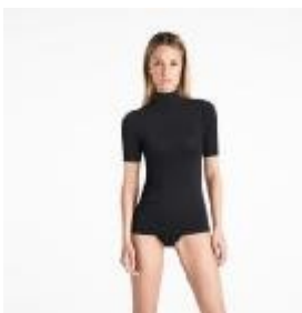
56218 Aurora Shirt