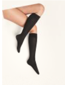
36000 Aurora Knee-Highs