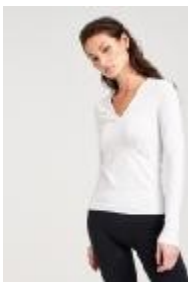
56223 Aurora Pullover