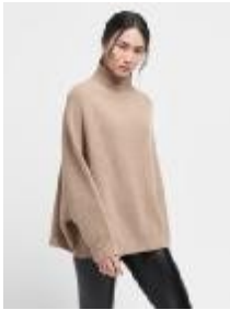
52749 Aurora Wool Pullover