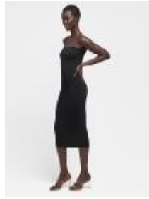
56222 Aurora Tube Dress