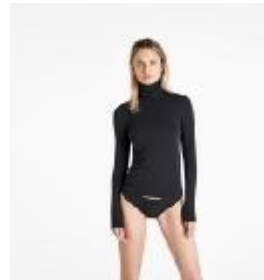
56216 Aurora Pullover