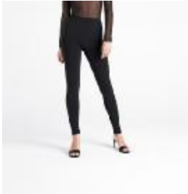
16008 Aurora Leggings