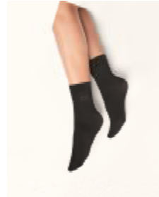
46000 Aurora Socks