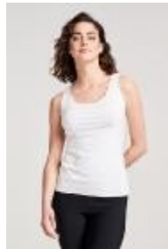
52730 Aurora Pure Top